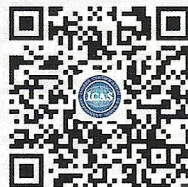
Focus on icas WeChat platform

Certification and Accreditation Administration of PRC:CNCA-R-2003-117 Tel: 400-633-9001 / +86 021-51114700 Web: www.icasiso.com Add: Room 801,HuaDing Mansion, 2368# West Zhongshan Rd., Xuhui District, Shanghai, China, 200235